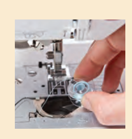
Drop-in bobbin Simply drop in a full bobbin, follow the thread guide and you are ready to sew.

Lock stitch button At the touch of a button, tie-off stitches can be easily sewn at the beginning and end of the stitch.