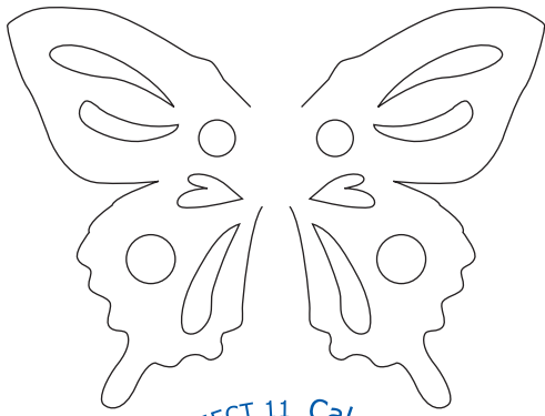
PROJECT 11 Calendar page 23